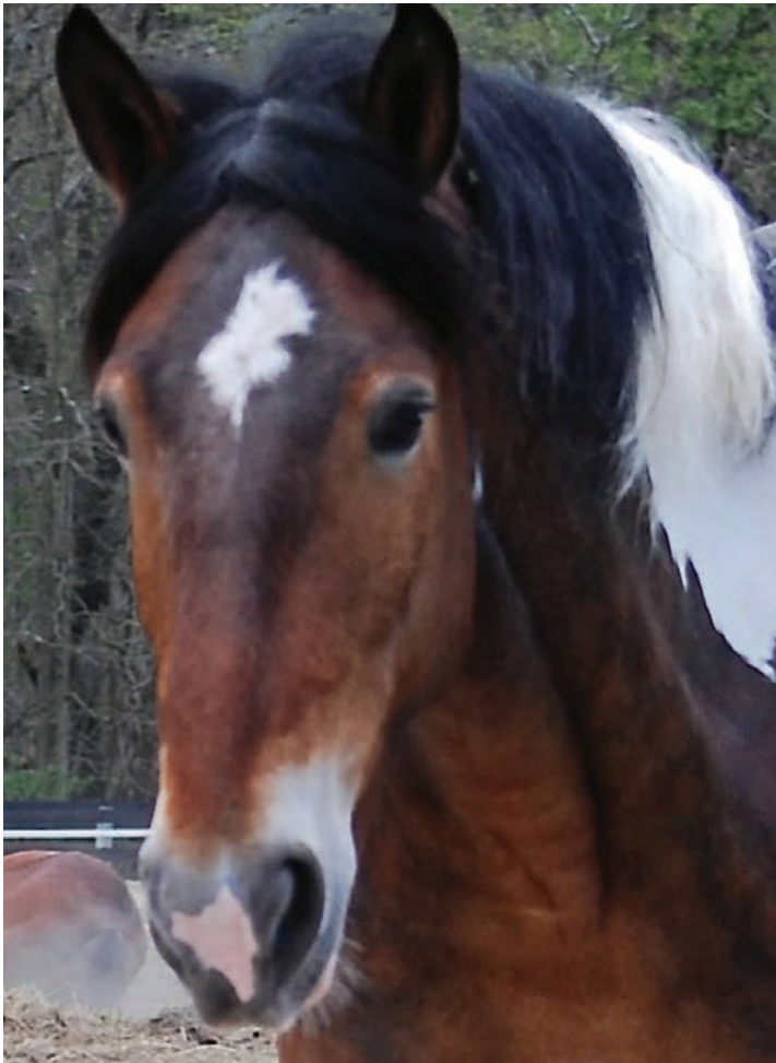
Dillon, a 5-year old Spotted Draft, is a very handsome fellow.